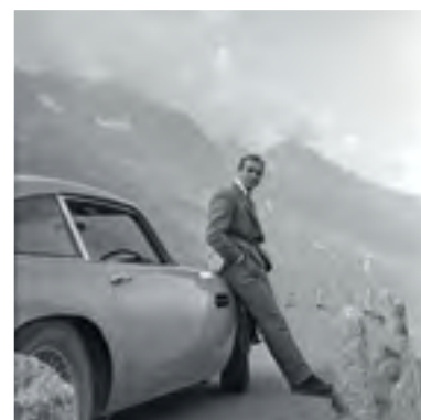
Sean Connery relaxes on the bumper of his Aston Martin DB5 during the filming of location scenes for 'Goldfinger' in the Swiss Alps. Copyright Notice - © 1964 Danjaq, LLC and United Artists Corporation. All rights reserved.

http://ptv.vic.gov.au/getting-around/maps/metropolitan-trams/view/1041