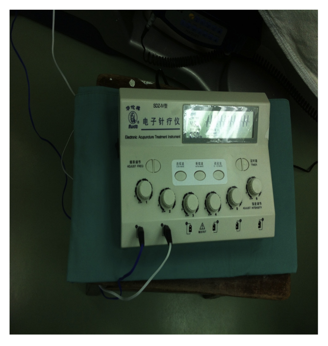
Figure 3 Electroacupuncture device used.

computed tomography brain scan postoperatively showed near complete evacuation of the subdural hemorrhage. The patient, who was satisfied with the overall procedure, was discharged without incident on postoperative Day 2.