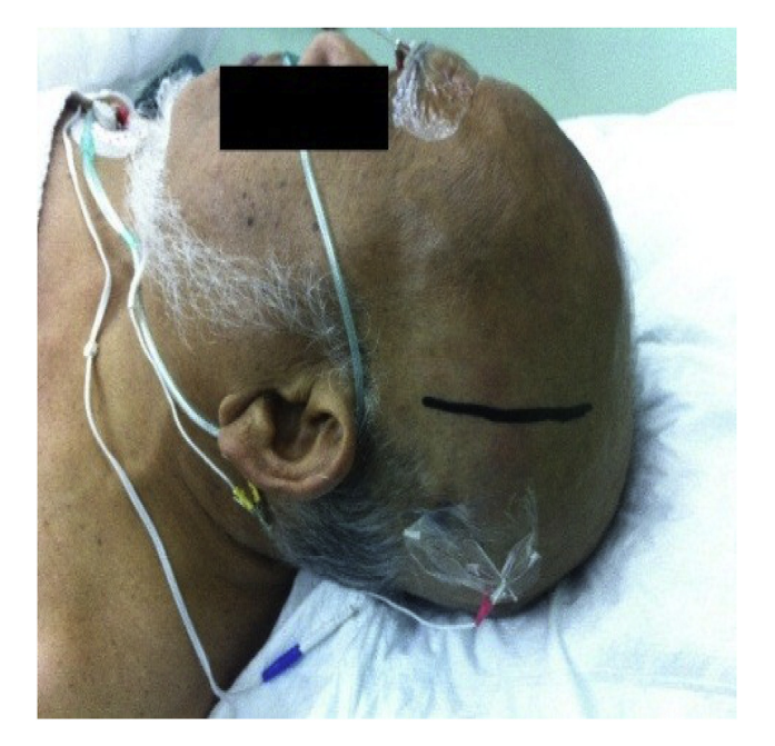
Figure 2 Acupuncture needles in situ preoperatively.