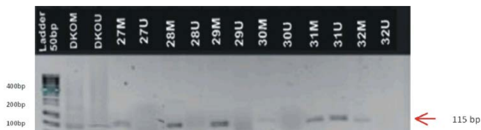
Fig. 1: Representative agarose gel electrophoretic image of methylation status for gene RRM2 in methylation control and tumour samples. DKO represents methylation control; M represents methylated alleles and U represents unmethylated alleles. Lane 1: ladder marker of 50 bp. Lanes 2 and 3: universal methylated (DKO M) and unmethylated control (DKO U). Lanes 4-15 represent methylation status of tumour samples. Samples no. 27, 28, 29, 30, 31 and 32 show methylated status.