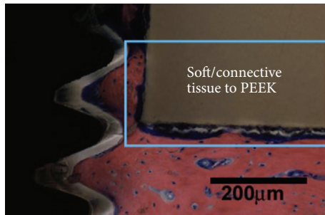
FIGURE 1: PEEK bioinert properties and growth of soft tissue around it [30].

much depends on the bioactivity of the implant. A material is considered bioactive if it obtains a particular biological answer to the interface of the element, which ends in the formation of a bond between the tissue and the substance [23].