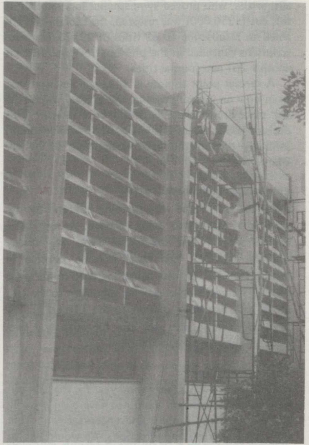
1 & 2 Cleaning the outside of the library building.