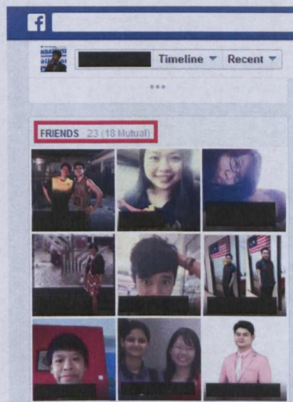
Picture 1. A Facebook's friends list of an adolescent with special needs.

The increased of opportunities for socializing and networking of the adolescents with special needs also evident in his newly developed Facebook. The picture (picture 1) above showed that his amount of friends connected in Facebook had increased gradually, from two to a total of 23 friends.