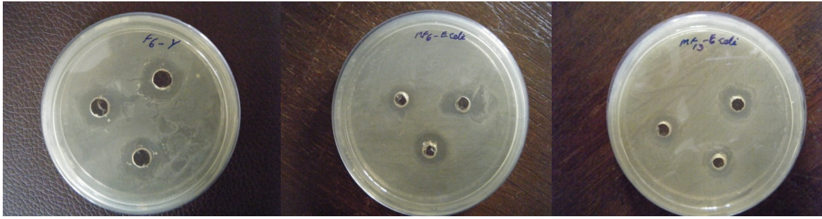
Plate 1: Petri Plate with a Lawn of an Indicator Pathogenic Strain and a Zone of Inhibition around the Well Containing the Culture-Free Filtrate of MF6 and MF13