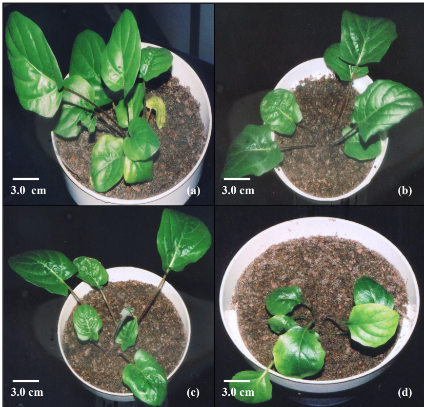
Figure 2. Three-month-old acclimatized plantlets; a) non-irradiated plantlets; b) irradiated at 10 Gy; c) irradiated at 20 Gy and d) irradiated at 30 Gy (plântulas acimatadas aos três meses de idade; a) plântulas não irradiadas; b) irradiadas com 10 Gy; c) irradiadas com 20 Gy e d) irradiadas com 30 Gy). Malaysia, Sultan Idris Education University, 2010.