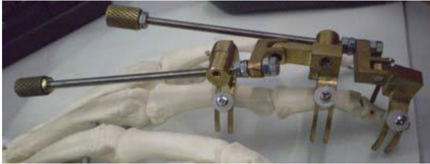
Fig. 1 The new external finger fixator consists of distal, middle, and proximal bracing segment which constructed on the skeleton model

The new external finger fixator consists of proximal, middle, and distal bracing segment which are adapted to stay in site relative to one another, for example as shown in Fig. 1. The design of the new external finger fixator was made through some revision to improve from the previous external finger fixator by Siow et al [6]. The geometry of each part was modeled by using Computer Aided Design (Pro-Engineer® version 3.0, PTC, Needham, MA) software and all parts for each component were imported into the solid modeller, ABAQUS/CAE 6.7 software enabling the finite element mesh to be generated for each component.