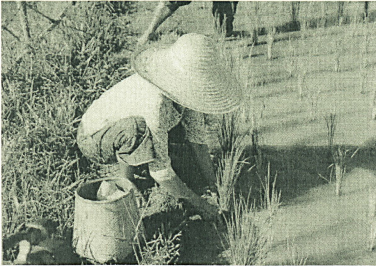
Photo 1: Performing for sacred- pa'atod hangod sending prayer to the spirits of rice field

The beating of the drum ( gandang ) led by a gong music called sompogogungan (comprised of 6 gongs) and the sumazau dance become a part of the ceremony. The gandang beating and the sompogogungan is believed to connect man with the spiritual world. It is done by a bobohizan while reciting an inait to assist the bobohizan to the spiritual world to meet, stir, and awake the bad spirits to ask them to return the trapped human spirits. A dish known as pamanta is prepared with the worship done stage by stage, following a pattern such as pason (order/call), matang (waking the spirit), tumingak (raising the spirit), savak (calling the spirit who left), mihung (calling the spirit to come near) and sumonson (invitation to enjoy the prepared dish).