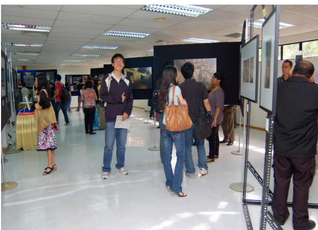
Students and staff of the University, and members of the public, at the launch