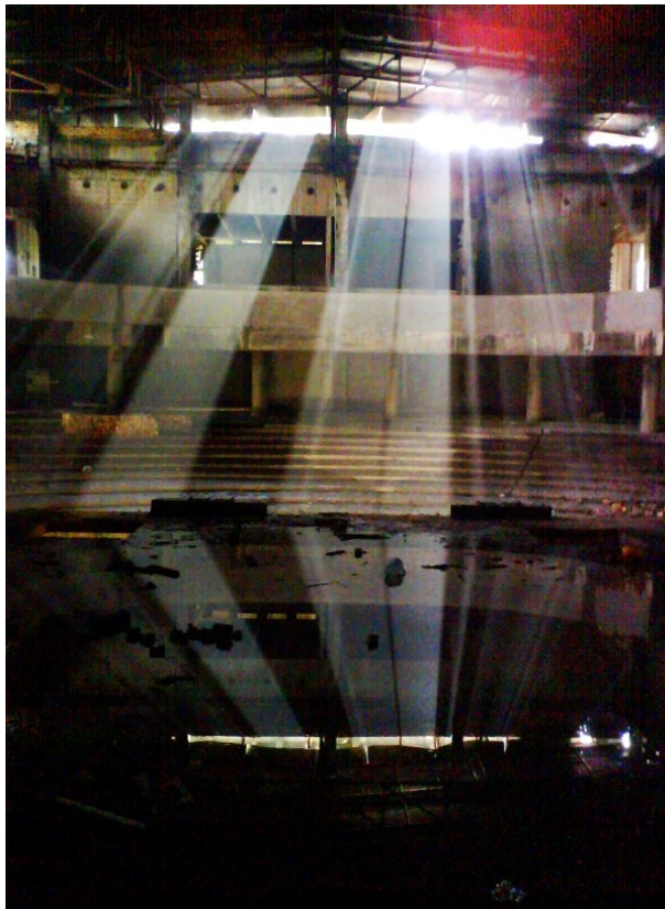
The picture that started it all