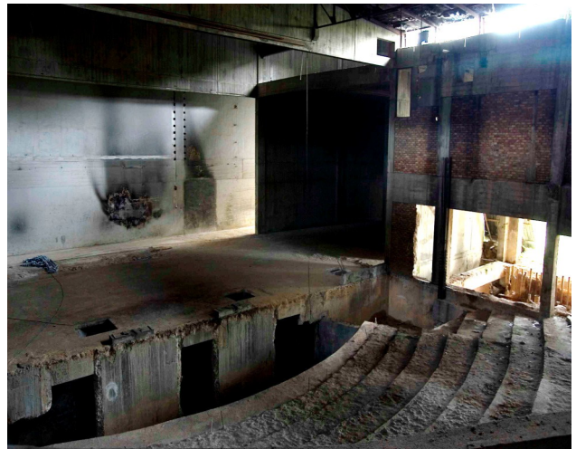
View of the E.T.’s stage from the gallery, October 2009

Among the graduation performances lined up are a dance, Mengadap Rebab (12 April), an original musical, Gouden Roos (16 and 17 April) and a music recital.