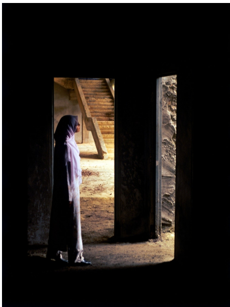
During the principal shoot in October 2009, the team sought to convey the theme of 'theatricality' using light, space and composition to evoke the textures of the E.T

Principal photography in October 2009 was funded by the Student Affairs and Alumni division on a budget of RM1,000. Working with an ambition somewhat greater than the budget would allow for, the team improvised and built lighting setups, D-I-Y-style. While most of the photographs were shot under natural light, some of the concept shots required artificial lighting. The team built flood-light stands out of angle-iron bars, and tapped the electricity outside the Bilik Anjung DTC using cable reels.