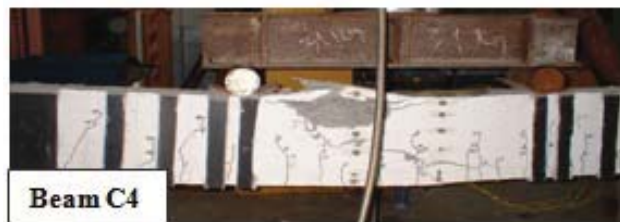
Plate 1: Failure mode of tested specimens