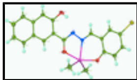
Fig. 1. The molecular structure of [ N' -(5-bromo-2-oxidobenzylidene- \kappa O)-3-hydroxy-2-naphthohydrazidato- \kappa^2 N',O ]dimethyltin(IV) showing 70% probability displacement ellipsoids and the atom numbering. Hydrogen atoms are drawn as spheres of arbitrary radius.