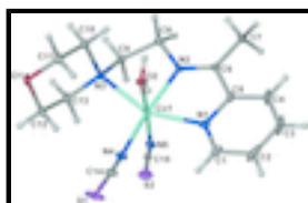
Fig. 1. Thermal ellipsoid plot of the title compound at the 30% probability level. Hydrogen atoms are drawn as spheres of arbitrary radii.