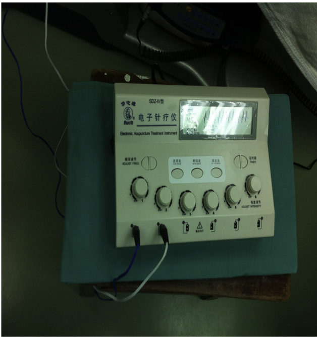
Figure 3 Electroacupuncture device used.

computed tomography brain scan postoperatively showed near complete evacuation of the subdural hemorrhage. The patient, who was satisfied with the overall procedure, was discharged without incident on postoperative Day 2.