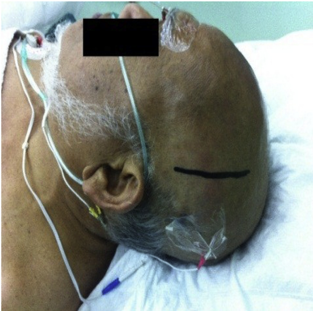
Figure 2 Acupuncture needles in situ preoperatively.