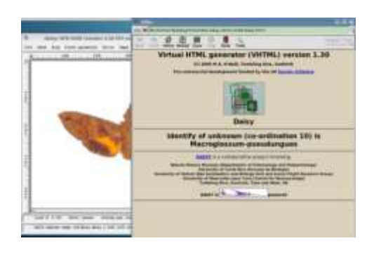
Figure 5: An example of correct identification of Macroglassum psedungus .

"identify" button was clicked on and a new window popped out for the result. If DAISY is able to identify the moth, the name of the species will appear as shown below (Fig. 5). Otherwise, it will return a wrong species name (wrong identification) or "not classifiable" or "below activation threshold affinity" instead.