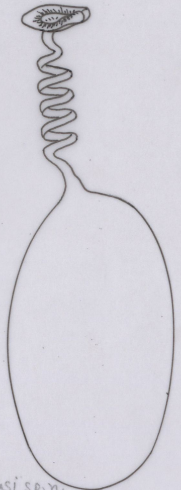
Thaparocleidus helicophagusi sp.n. from Helicophagus waandersii sp.n.