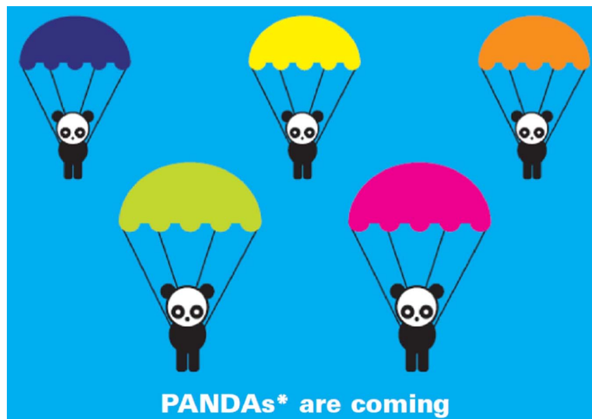
Figure 1 PANDAs postcard: an example of the viral marketing strategy to recruit practices.

consent to the study was obtained by the researchers. Practices were incentivised to take part in the trial, receiving a nominal payment to cover legitimate expenses.